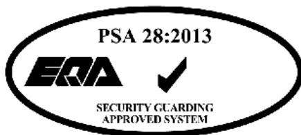
Example 1: Without Certificate Number