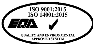
Example 1: Without Certificaiton Number

5.6 The EQA logo with or without Certificate Number can be displayed on Stationary, Letterheads, Website, Business Cards, Advertising, Flags, Vehicles and pamphlets etc. If the Certificate Number is to be incorporated with the logo, it should be placed directly underneath the logo (see examples below)